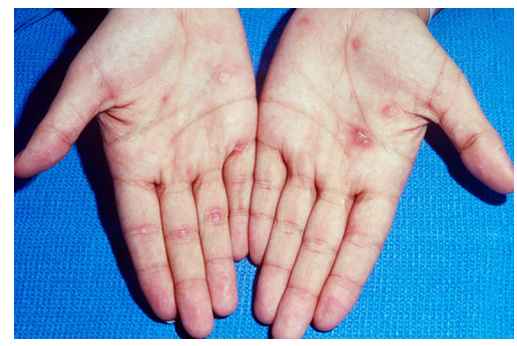
Fig 6 Secondary syphilis on palms of hands