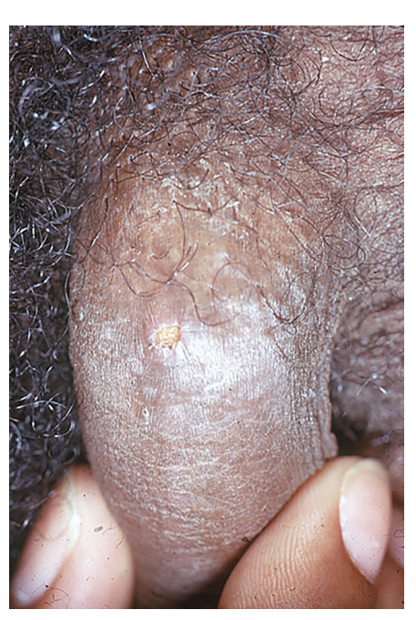
Fig 4 Inconspicuous syphilitic chancre on penis