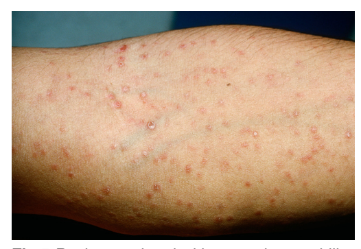
Fig 5 Rash associated with secondary syphilis