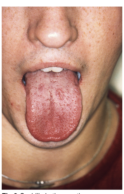
Fig 3 Syphilis in the mouth