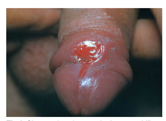
Fig 2 Chancre (sore) on penis due to syphilis